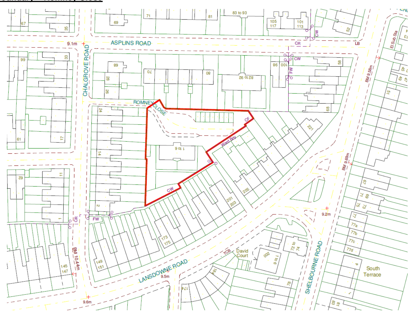
Appendix 1 Site Red Line Boundary – Romney Close